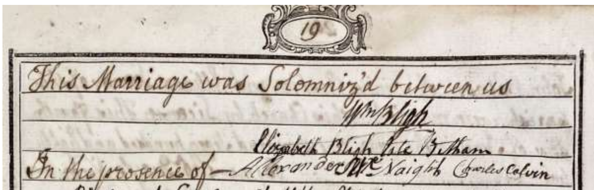
Onchan register entry of 1781 recording signatures of William Bligh and his bride MS 09754/3/1