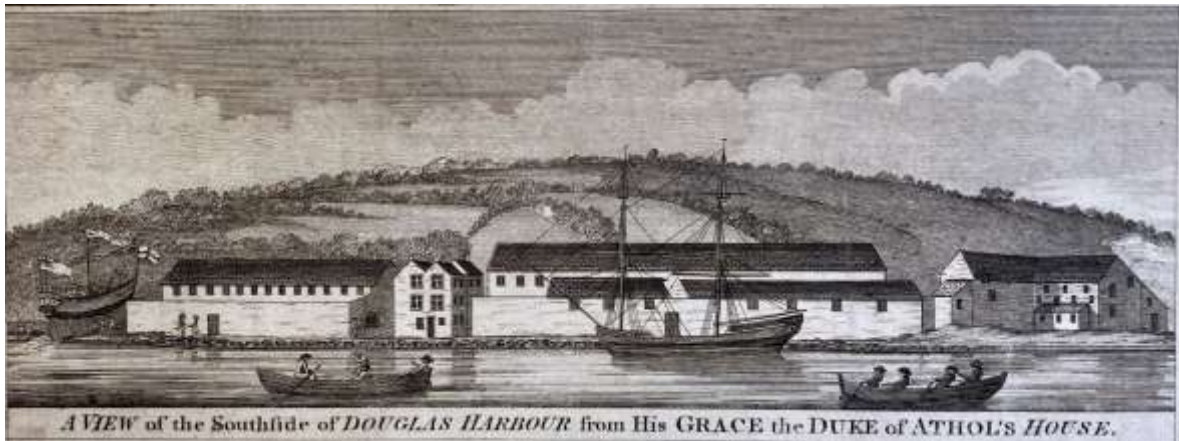
South Quay as it appeared at the time of the mutiny within a 1789 map by Peter Fannin (pXX 2 L)

At the time of writing this guide, a useful site was https://bountyproject.co.uk/mutiny/