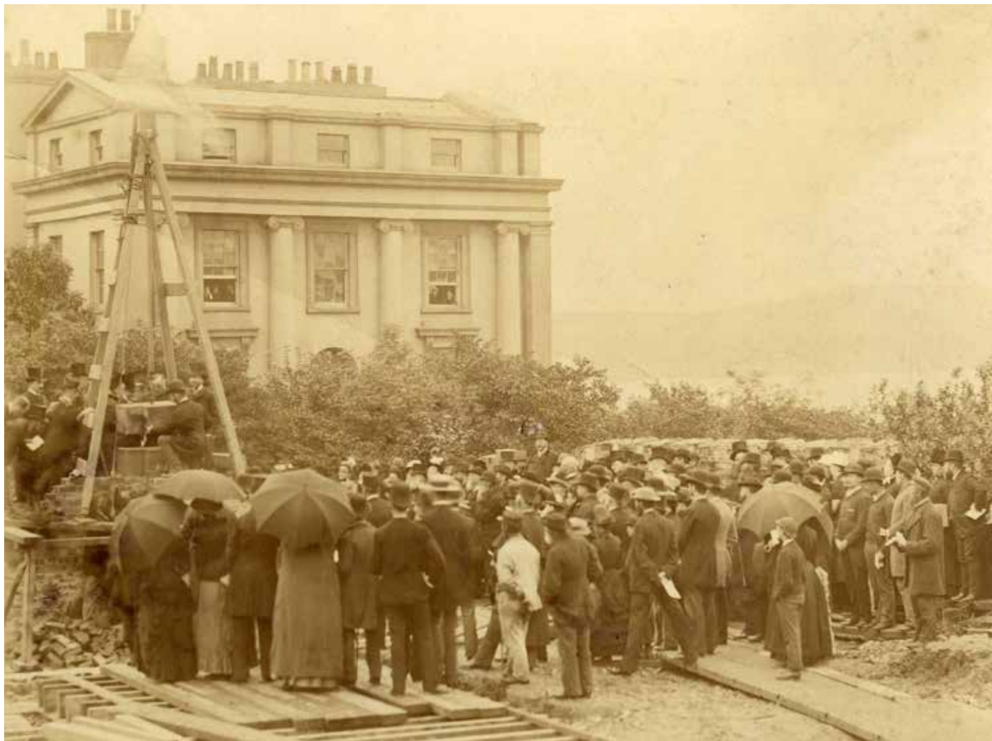
Laying foundation stone of Noble's Isle of Man Hospital, Douglas on 26 July 1886.

MNH website home page: https://manxnationalheritage.im