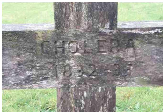
Simple cross marking the cholera pit, St George's churchyard, Douglas

Anti-vaccination responses to evidence arguing for compulsory vaccination. Published by The British Union for the Abolition of Vivisection. Library Ref: B.464/2xf