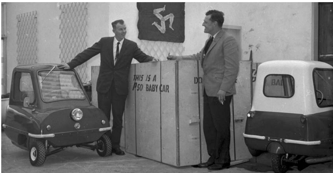
The Manx manufactured Peel P50, launched in 1962 as a single seat, fibre glass, three-wheel motoring option, was perhaps the most unusual vehicle to bear Manx number plates