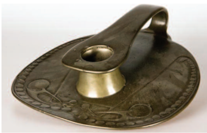
Liberty Tudric pewter chamber or candlestick 2001-0073