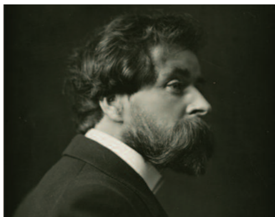
Archibald Knox - studio portrait PG/5515/3

Towards the end of his life, living and working once more in the Isle of Man as an art teacher at Douglas High School Knox was in great demand locally as a book illustrator and designer of illuminated addresses and public memorials, examples of these commissions are held in the Museum's collections.