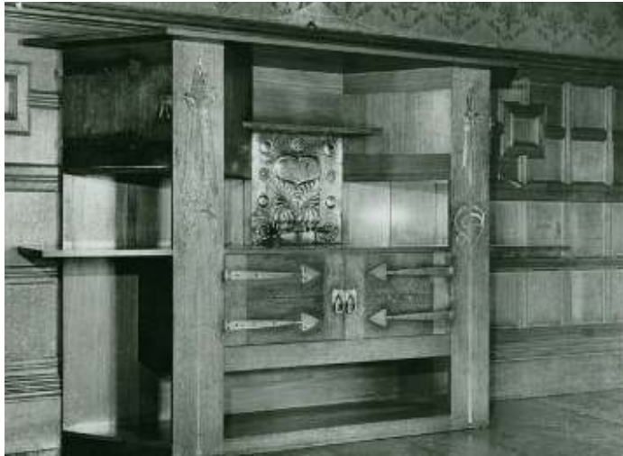
Dining room cabinet at Glencrutchery House