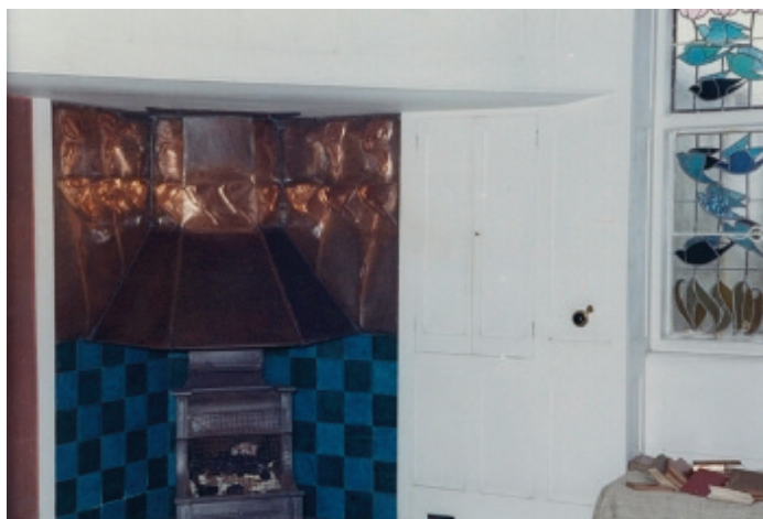
Hall at Glencrutchery House.