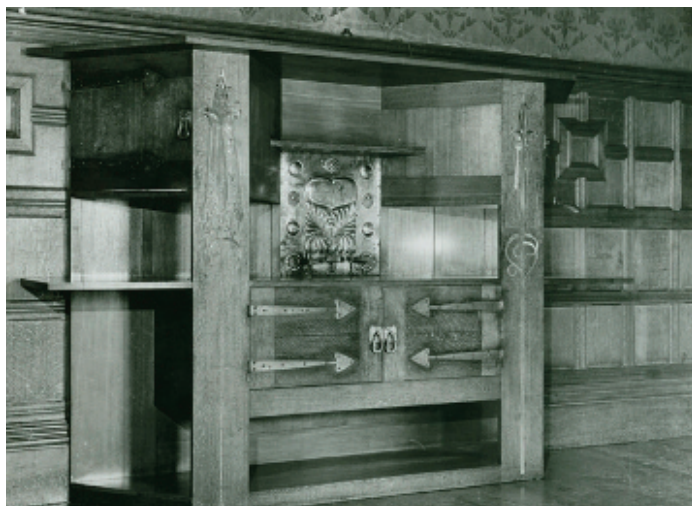
Dining room cabinet at Glencrutchery House

Examples of interior design copied from www.imuseum.im