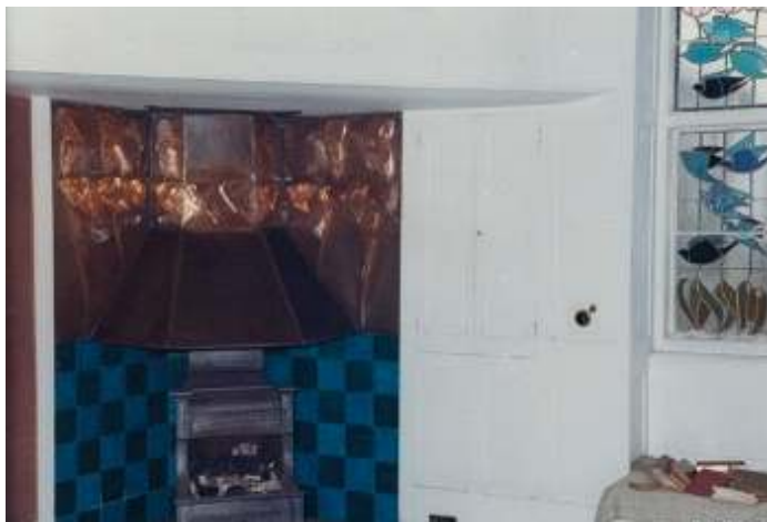
Hall at Glencrutchery House.