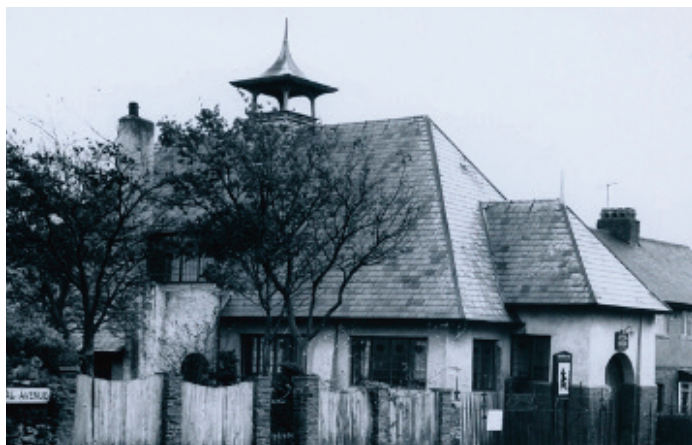
Onchan Parish Church Hall, Royal Avenue, Onchan (1896)

The museum collections include a locally made settle, an iron fire grate with dogs, a copper panel and a stained glass window. The latter are on display in the Social History Galleries at the Manx Museum.