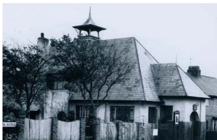
Onchan Parish Church Hall, Royal Avenue, Onchan (1896)

The museum collections include a locally made settle, an iron fire grate with dogs, a copper panel and a stained glass window. The latter are on display in the Social History Galleries at the Manx Museum.