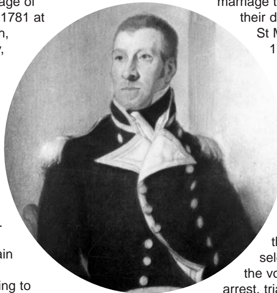
Peter Heywood