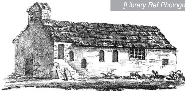
Onchan Church [From An Appeal on behalf of the Poor Churches in the Diocese of Sodor and Mann c. 1830 [Library Ref E205/5(1)F]

The leader of the mutineers was Fletcher Christian. Although from Cumberland, which is just across the sea from the Isle of Man, he was related to the Christian family of Milntown near Ramsey and maintained links with the Island. Christian had sailed with Bligh before.