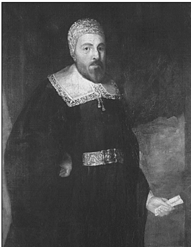
ABOVE: William Christian, also known as Illiam Dhone. Detail from the oil painting on display in the National Art Gallery at the Manx Museum in Douglas

This bibliography concentrates on secondary printed sources but the Library also holds a wealth of original material in the archives: much of this is often difficult to read to the unaccustomed eye due to the style of handwriting prevalent at the time.